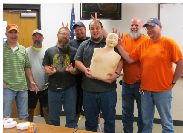
EMERGENCY FIRST RESPONDERS IN ACTION