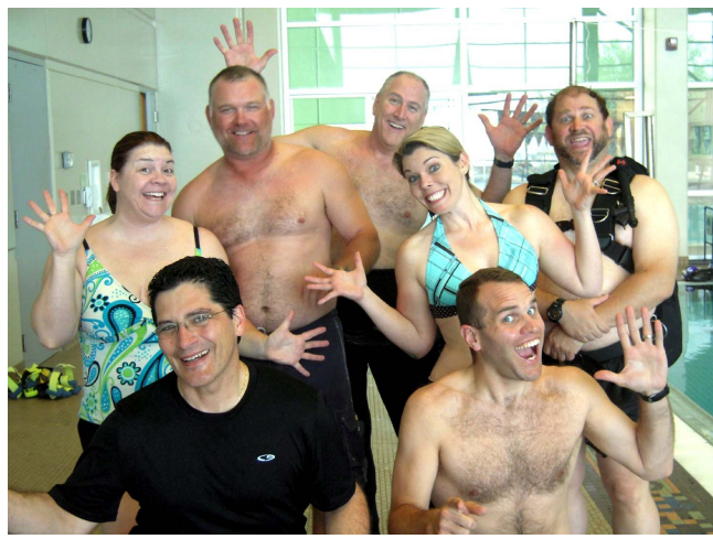
NOW READY FOR BLUE WATER

WITH AMBER WAVES DIVING EVERY WEEKEND IS A DIVE WEEKEND